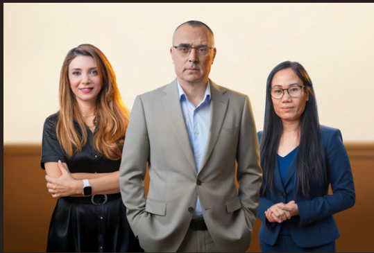
MANAGEMENT & LEADERSHIP

UNEC Joinery brings together more than 80 professionals across all business functions, combining operational strength, technical expertise, and leadership experience. Our core departments include: