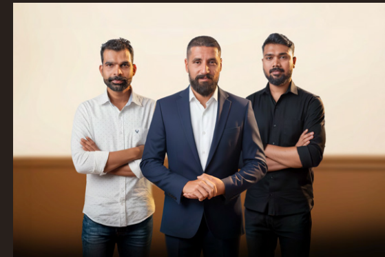
TECHNICAL & ENGINEERING