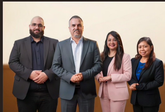
HUMAN RESOURCES (HR) & FINANCE