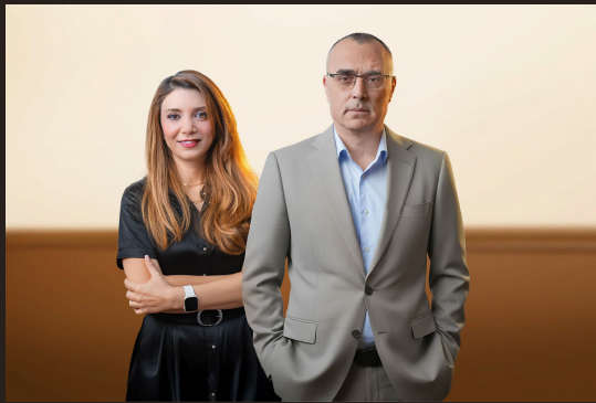
MANAGEMENT & LEADERSHIP

UNEC Joinery brings together more than 80 professionals across all business functions, combining operational strength, technical expertise, and leadership experience. Our core departments include: