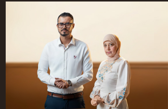
COST CONTROL & QUANTITY SURVEYING (QS)